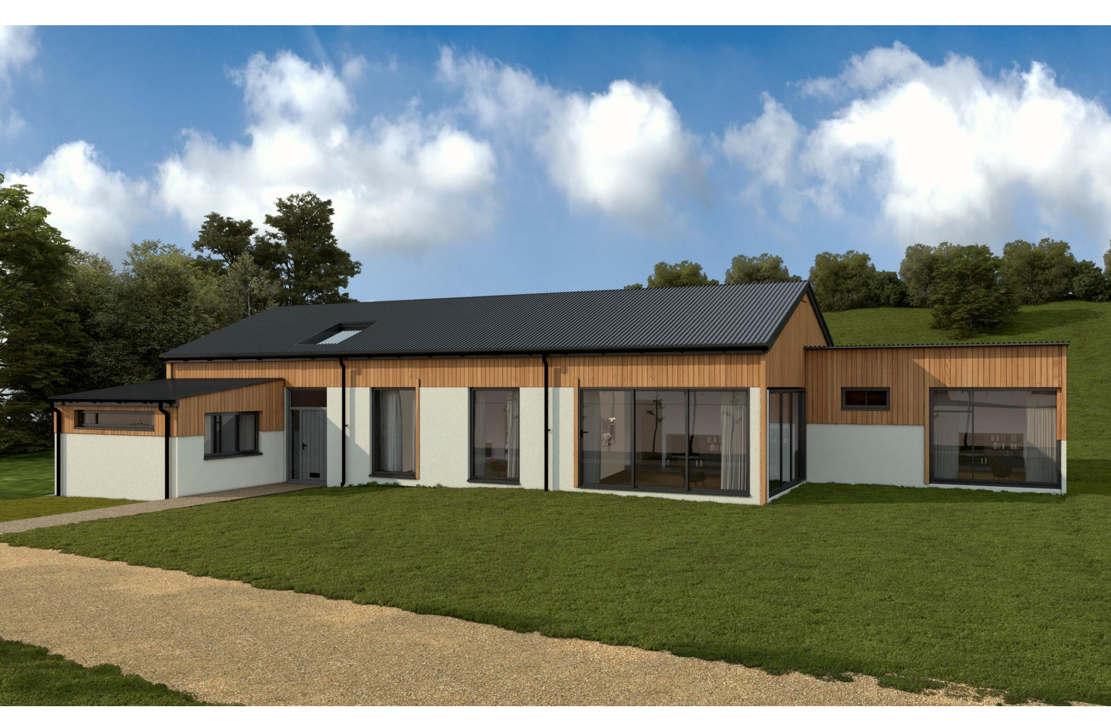
All plans and computer generated images are for illustration purposes