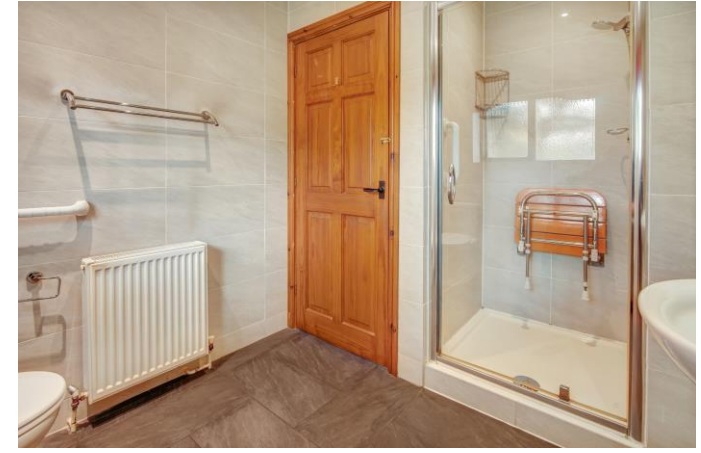
heating and hot water. LPG bottled gas to fire in living room.

Mains electricity, water and drainage are connected to the property. Oil-fired Grant combi-boiler for central